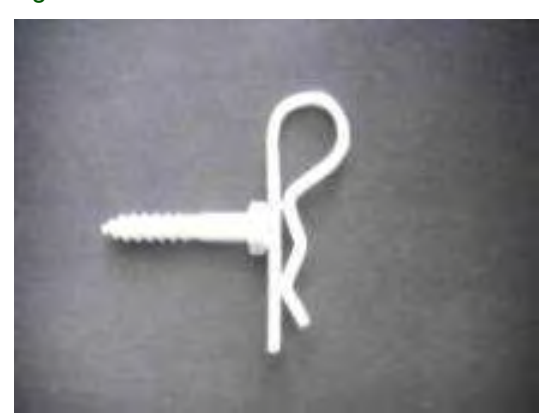
Figure 4.4 R Shear Clip Design