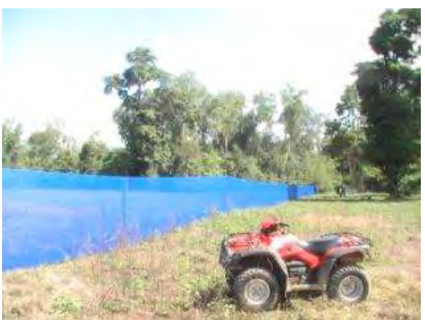
Figure 4.7 Trial #2 Sag Test