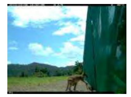
Figure 4.37 Wallaby testing fence