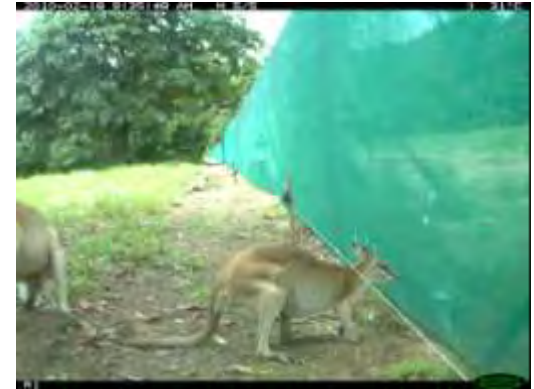
Figure 4.40 The deterrent has not yet worked

Monitoring cameras recorded two occurrences of cassowaries approaching the fence and one scat was recorded in the vicinity during one of the cassowary surveys.