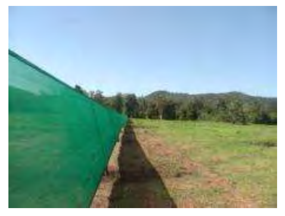
Figure 4.19 fence lay down from high wind

Three cyclone events occurred during early 2010-2011 cyclone season;