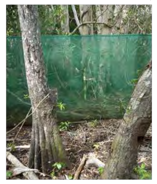
Figure 4.14 Side view Fence through riparian vegetation. Untouched for 1\frac{1}{2} years

The fence within the vegetation suffered no damage over the 2009/10 wet season with a number of small branches falling on the fence; not sufficient to release the shear clips and one section of fence partially flooded without damage to the fence. During the 2010/11 wet season the sections of fence were left erect for all cyclone events without being dropped.