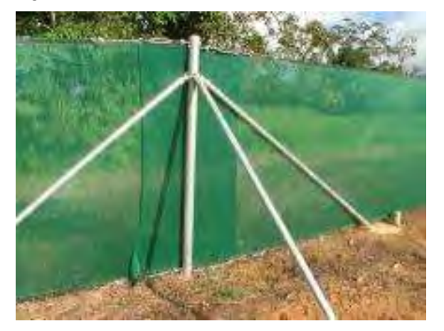
Figure 4.8 Pipe Strainer Design

The timber strainer posts were replaced with an 80mm steel pipe assembly structure with 40mm steel tube braces assembled with standard universal galvanised fence fittings. CCA treated pine logs were used for the mid-span posts at 12m spacings.