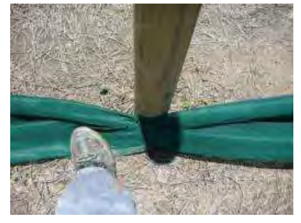
Figure 4.13 Contained fence to posts