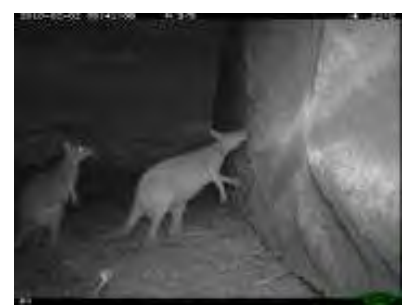
Figure 4.33 Wallaby attack on the fence

The holes were repaired by hand stitching a shadecloth patch or silicone gel to bond the materials together and at some locations logs were placed along the fence where the terrain dipped and created a larger gap between the fence and ground to dissuade digging.