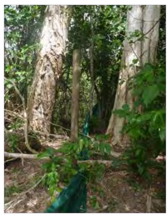
Figure 4.28 Cyclone Yasi 200m fence dropped and tied (no damage)