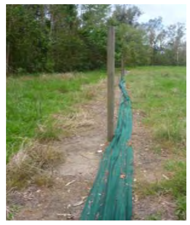
Figure 4.20 Cyclone Yasi 100m fence dropped and tied - no damage