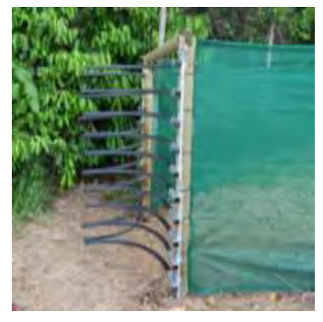
Figure 4.31 Cassowary Gate