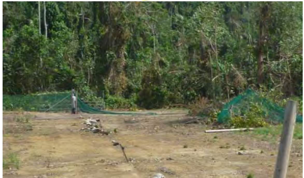
Figure 4.27 Cyclone Yasi 300m fence Northern end. Fence into the vegetation intact and undamaged. The section of fence and posts from the mid-strainer destroyed.