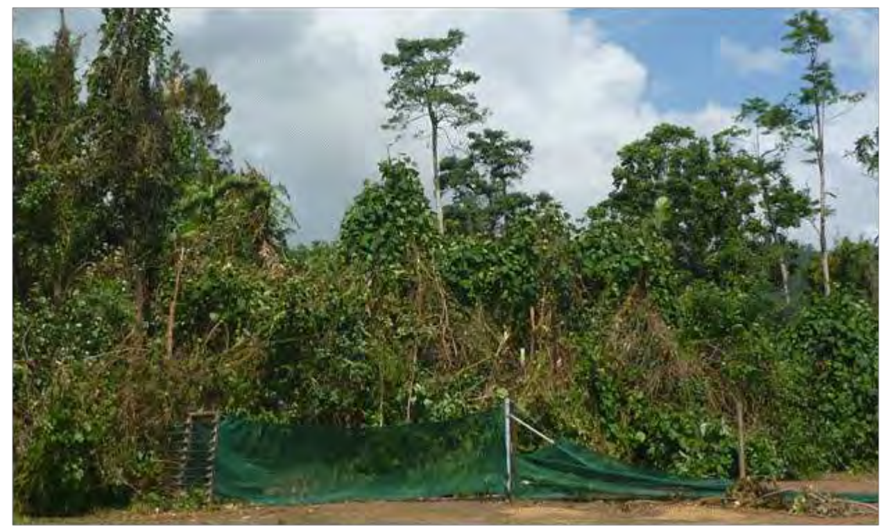
Figure 4.26 Cyclone Yasi 300m fence – Southern end. Cassowary gate and local shadecloth intact. Note vegetation damage behind fence.

The southern end was less damaged due to the predominant cyclone wind direction from the south. The shadecloth fence locally around the end strainer and the short length to the cassowary gate and within the vegetation were intact. The shade cloth was torn at attachment to the southern strainer assembly and at one mid-span post where the shear clip did not release. Only one mid-span post was dislodged. The vegetation damage directly behind the cassowary gate in Fig 4.26 is testament to the wind intensity.