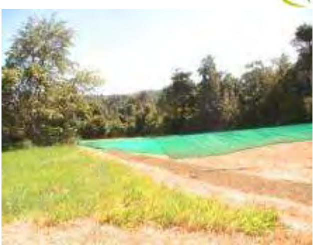
Figure 4.10 Fence sag test – no posts