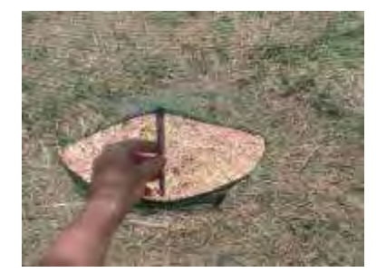
Figure 4.34 Hole from wallaby claw