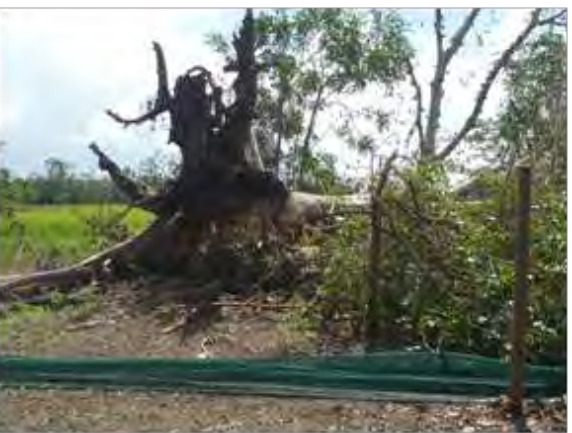
Figure 4.25 Cyclone Yasi 300m fence south. Tree up-rooted, no damage locally