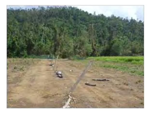
Figure 4.23 Cyclone Yasi 300m fence north. Shade-cloth stripped and posts removed