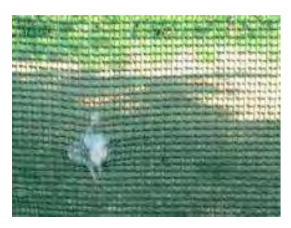
Figure 4.38 Temporary repair using silicone

The extent of the repeated wallaby attack was unexpected and various efforts were trialled including gas cannon, Bitterant spray, and killing the grass for a further 20m to the fence without success. The only deterrent to be effective was a single electric wire running approximately 300mm above the ground. This instantly stopped the attacks and little further damage was caused. It is interesting that the wallabies repeatedly attacked the fence but did not venture around the ends of the fence through the vegetation or cross the creek from other clearings to reach the newly planted palms and shrubs.