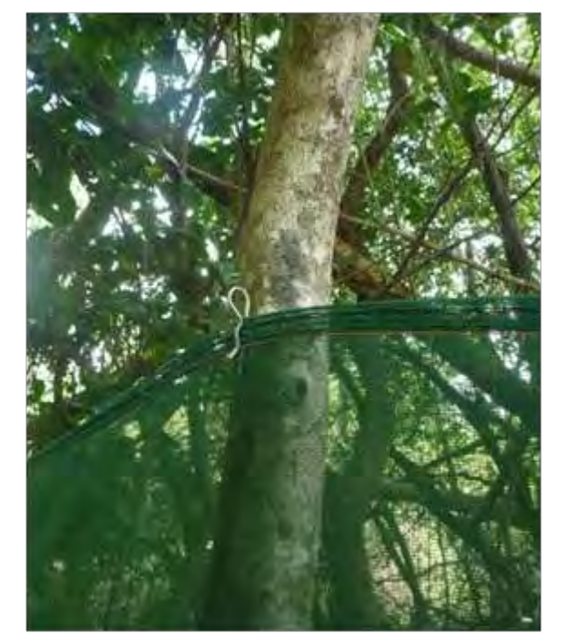
Figure 4.15 Shear clip attachment to tree using coach screw Untouched for 11/2 years