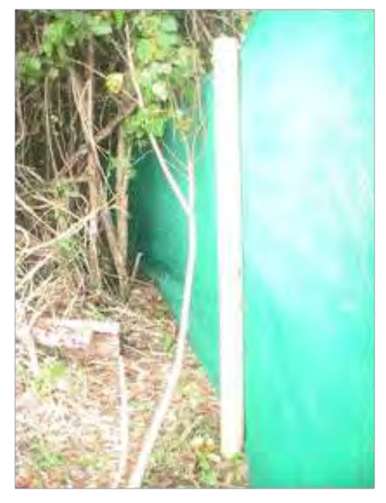
Figure 4.17 Fence within, dense vegetation showing minimal clearing