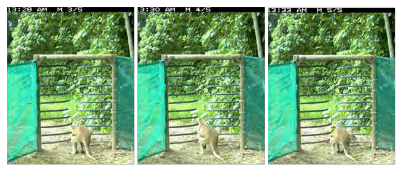
Figure 4.32 One of numerous examples of Agile wallabies using the cassowary one-way gate