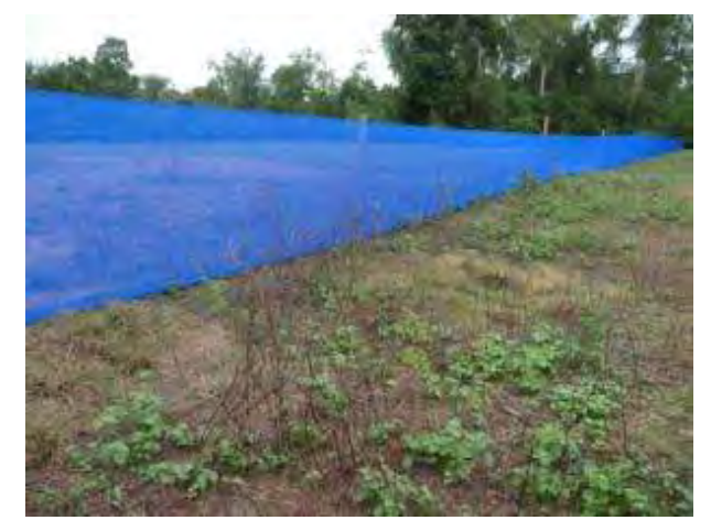
Figure 4.6 Trial #2 Fence completed

The diameter of the 2.8mm wire with the shadecloth was insufficient to be held within the R clip and some of the clips released immediately. Standard "Maspro clip" wire was used to hold the ends of the R-clips together and to create a stronger shear tension. Maspro clips were installed for the entire fence length.