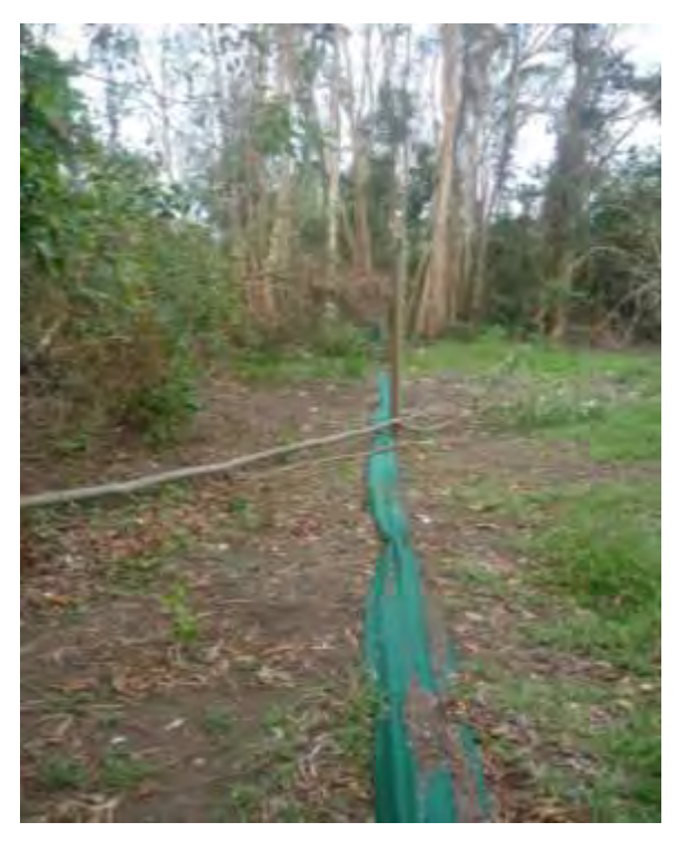
Figure 4.21 Cyclone Yasi 200m fence dropped and tied – no damage