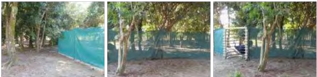
Figure 4.1 Trial #1 Fence and Cassowary Gate