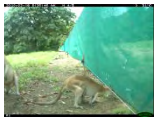
Figure 4.39 Wallaby testing the electric fence

It appears that the habituation of the displaced wallabies to that area was strong. After 12 months with an energised electric fence the fence was turned off and there were very few attempts to cut through the shadecloth.