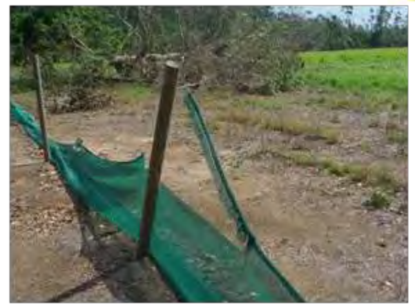
Figure 4.24 Cyclone Yasi 300m fence - south. Clip did not release and fence ripped