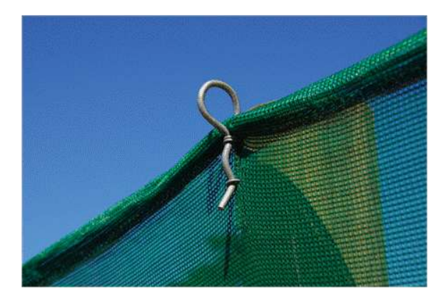
Figure 4.5 R Shear Clip installed

The benefit of the R shear-clip is that the horizontal forces on the wire can be contained but the fence will be released when a vertical downforce is applied (ie falling branch). Once the clip or a number of clips are released the top wire will be required to suspend the fence with tolerable sag until maintenance staff can insert the wire back into the clip.