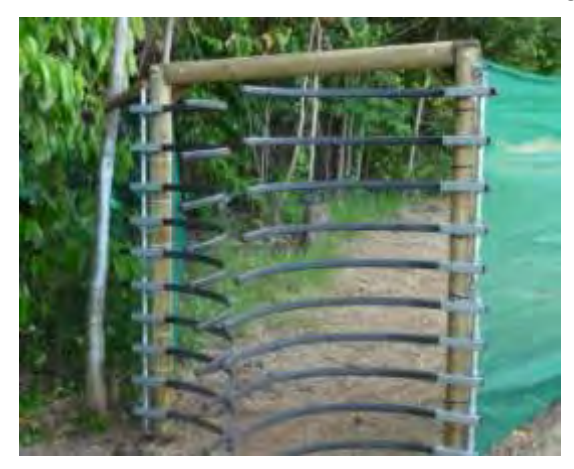
Figure 4.30 Cassowary Gate Revegetation site

However Agile wallabies were recorded using the gate on numerous occasions. It appears that if the wallabies accessed the revegetation they then exited through the cassowary gate. there are no instances of the wallabies accessing the gate from the incorrect one way direction.