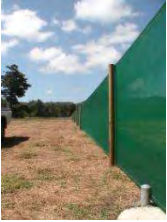
Figure 4.11 Fence erected for revegetation lot.

The second trial was to complete the fence by clipping up the top wire and then trial dropping the fence to simulate a cyclone event. The fence was dropped down by one person by untensioning the turnbuckles and eyelet bolts. The shadecloth was rolled and secured to the posts by the use of a plastic cable tie.