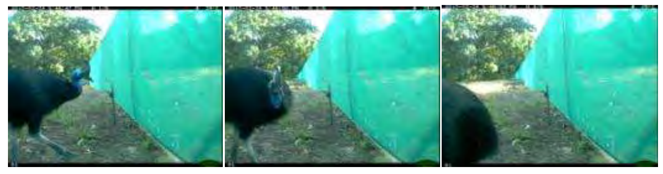
Figure 4.41 Cassowary interaction with the fence showing the cassowary turning and walking away. .

is a totally different behaviour to that reported and observed with Cyclone mesh fences where the cassowary tracks repeatedly back and forward along the fence and demonstrates the same behaviour observed with the captive cassowaries at the Johnstone River Crocodile Farm.