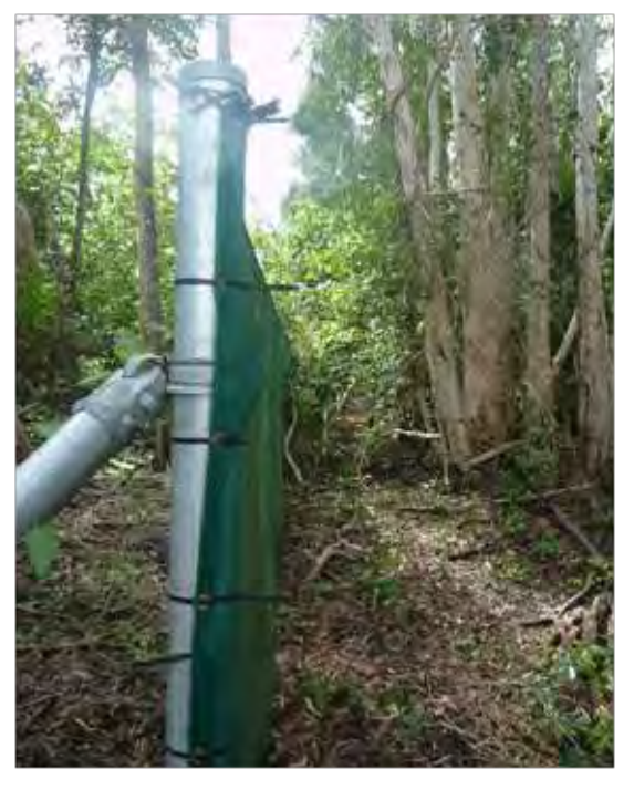
Figure 4.16 End View Fence through riparian vegetation Untouched for 1½ years