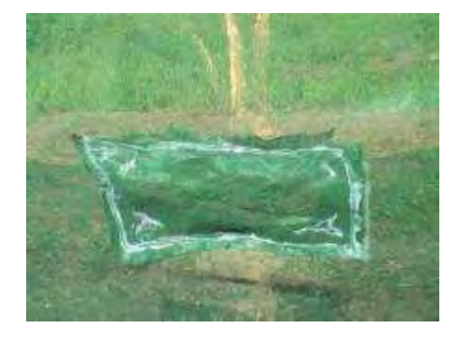
Figure 4.36 Temporary repair using glue on patch